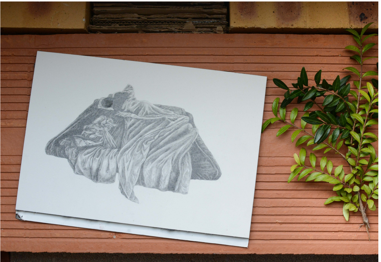
Candice Lin, detail from A Hard White Body , 2017.