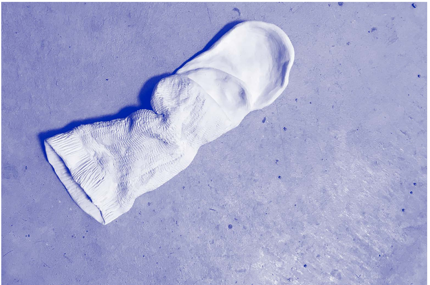
Candice Lin, detail from A Hard White Body , porcelain, 2017. Courtesy the artist