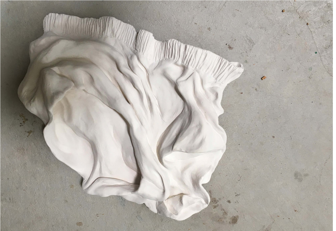
Candice Lin, detail from A Hard White Body , porcelain, 2017. Courtesy the artist