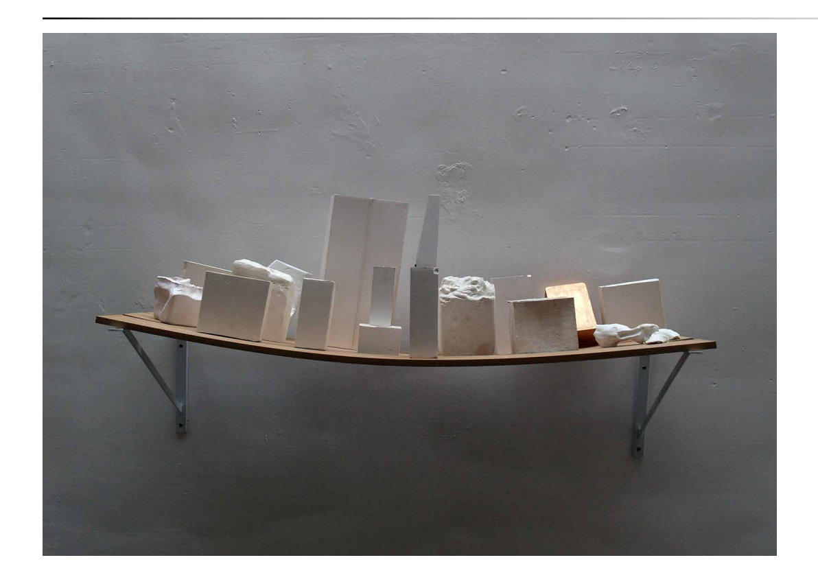
Alice De Mont, study, test block, test shelve, test room, 2011 Courtesy : Alice De Mont