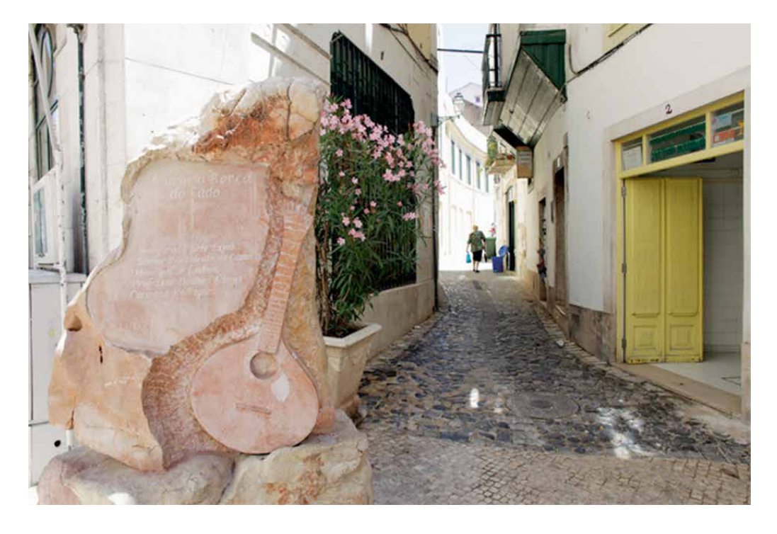
Photographe of Museum of fado's facade, Lisbon, 2013