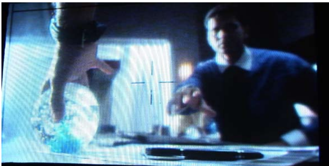
Still from Otolith II , 2007 HD video (colour, sound) 47min 42 sec UK / India © The Otolith Group

To request high resolution images please contact : presse@betonsalon.net