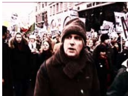
Stills from Otolith I , 2003 Video (colour, sound) 22min 16sec, UK