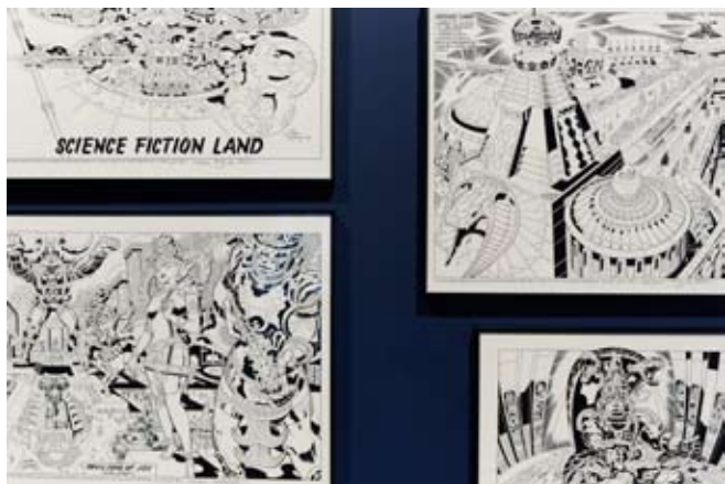
Jack Kirby, detail of 4 photographic prints, archival quality photographic paper, limited edition, 9 in a serie of 12, exhibition view "Thoughtform" at MACBA, Barcelona, 2011