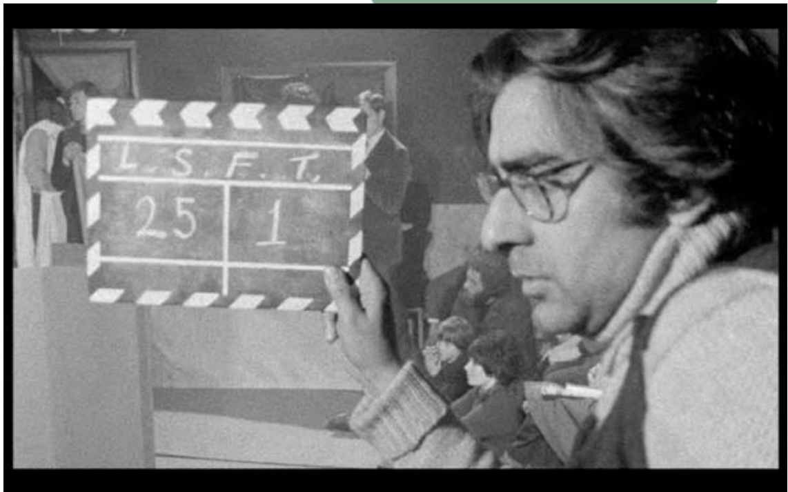
Still from Otolith II , video, 2007