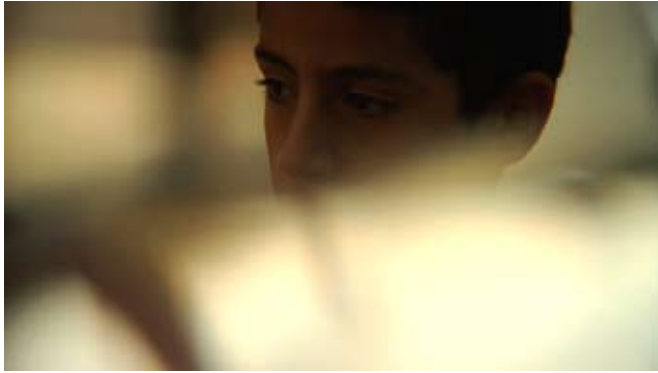
Stills from Otolith III , 2009 HD video (colour, sound) 48min UK © The Otolith Group