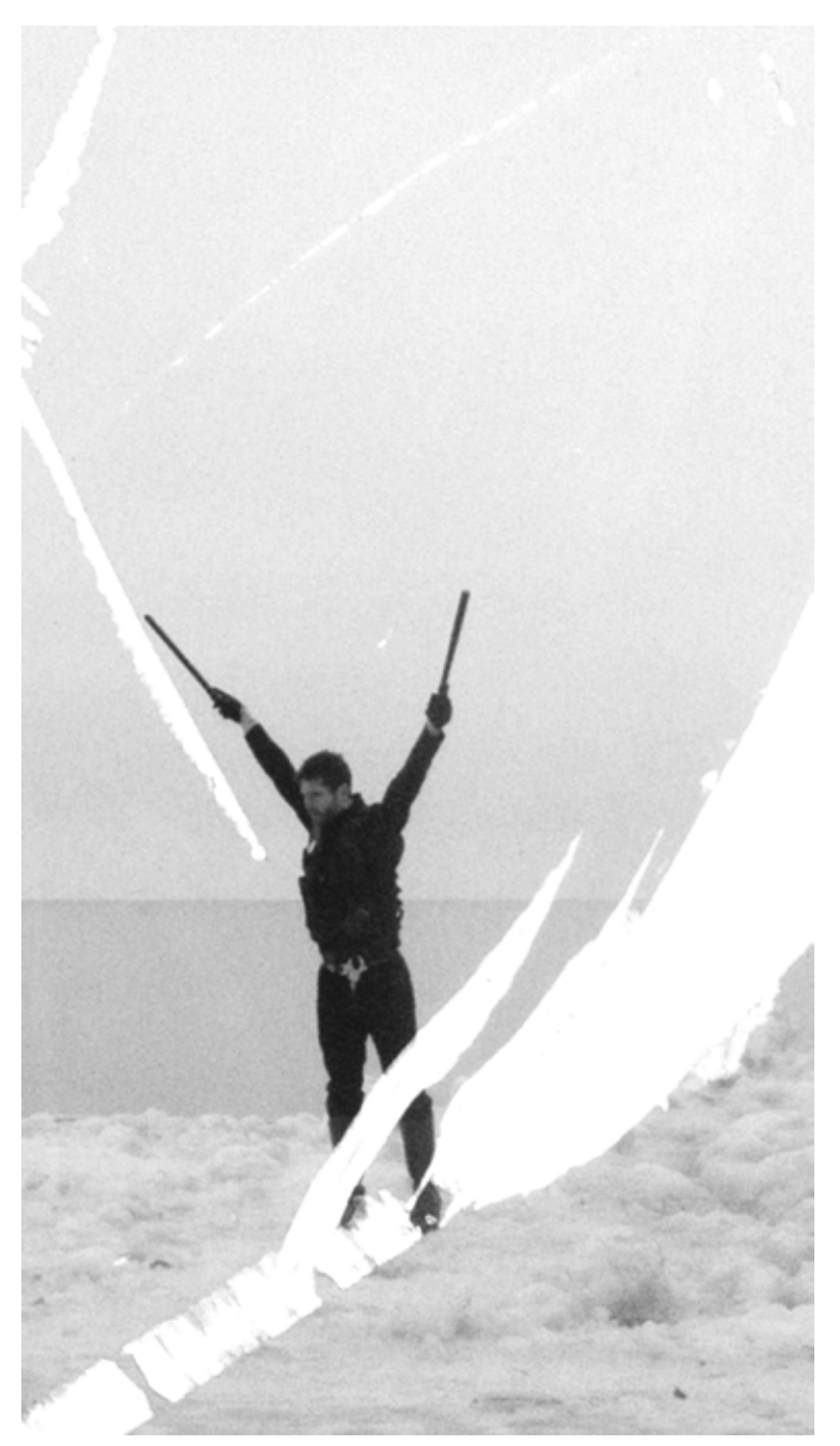
Karthik Pandian, Chrysalis , 2014, HD video still

The butterfly in the chrysalis is not only blinded but also suspended, weightless. I imagine it's an experience not altogether unlike floating in a sensory deprivation tank, which is something I've been doing in lieu of going to the studio lately. The «films» I work on in there are like a cinema of pure potential – timeless, edgeless, disembodied. This blindness can be productive; it puts pressure on appearance, makes you see differently, etc. But there's also a Bartleby dimension to it. A preference not to produce. An effort to accumulate instead of expend intensity. An attempt to commune with sheer negativity that perhaps draws us closer to being. The purest light is the imagined light, the one that emanates from our consciousness, projected into the void [...].