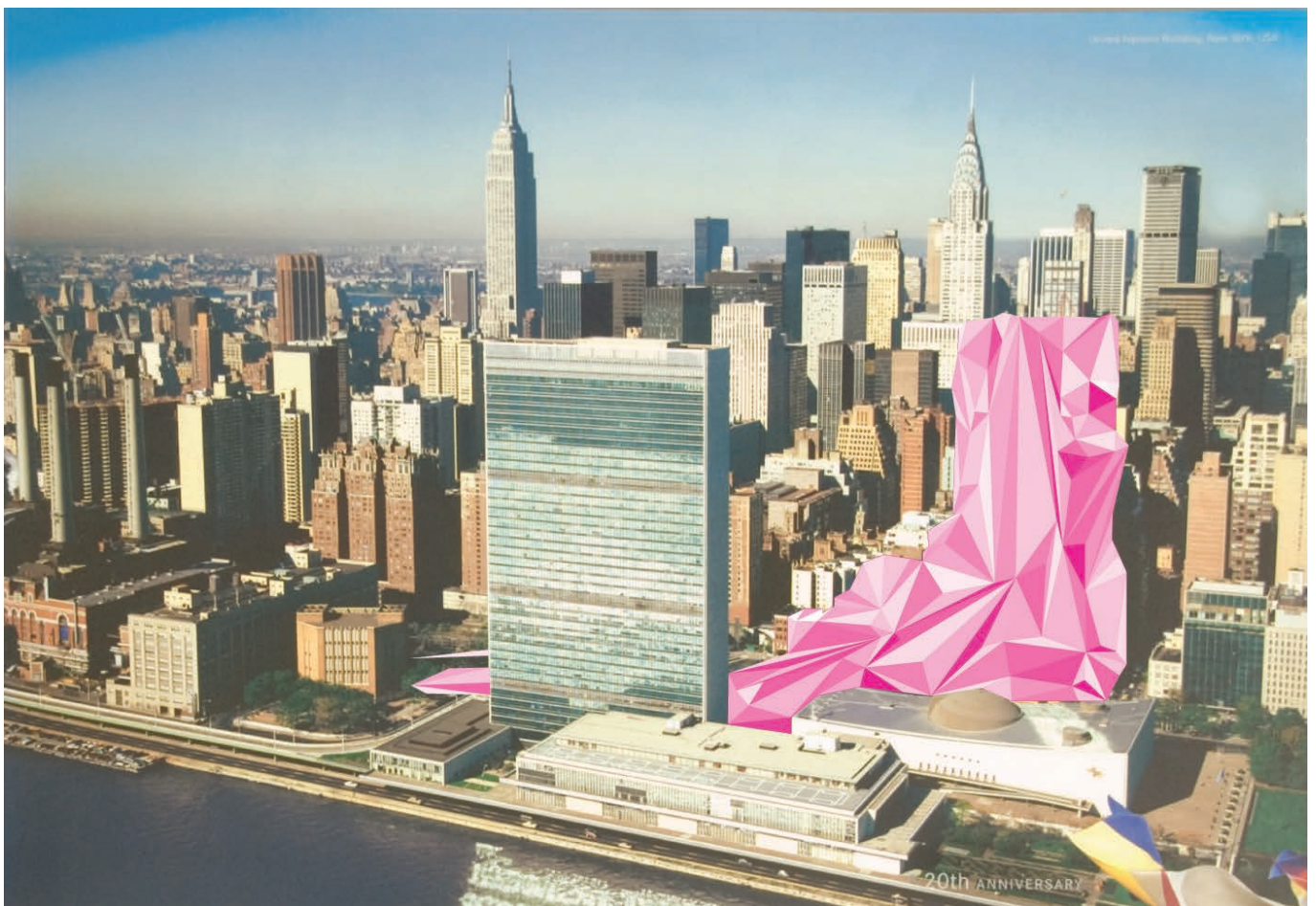
Tran Minh Duc, Normal day No.2 (some day in NY) , 2010