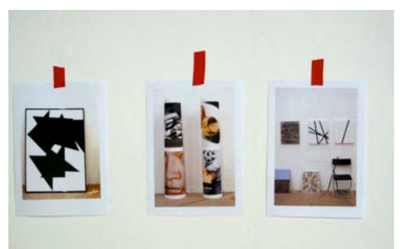
Chloé Quenum, En Mai fais ce qu'il te plait s'il te plait, 2009 (detail) Installation